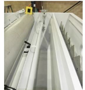
Left: (From left): Diffusion chamber with reaction jet baffles, screw conveyor for solids removal, and chain and flight drag conveyor. Middle: Chain and flight surface skimmer and drag conveyor in separation and settling zone. Right: (From left): Automated oil roll, adjustable pipe skimmer, underflow baffle, and adjustable overflow weir.

parallel plate packs can be added to existing API Separators to increase the effective surface area which will provide increased oil removal and increased wastewater flow capacity.