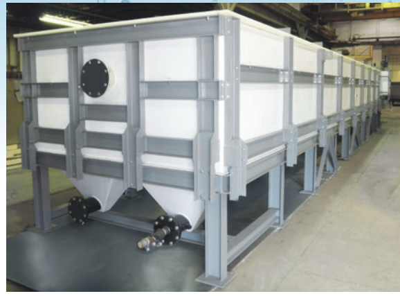
Left: Circular Separator