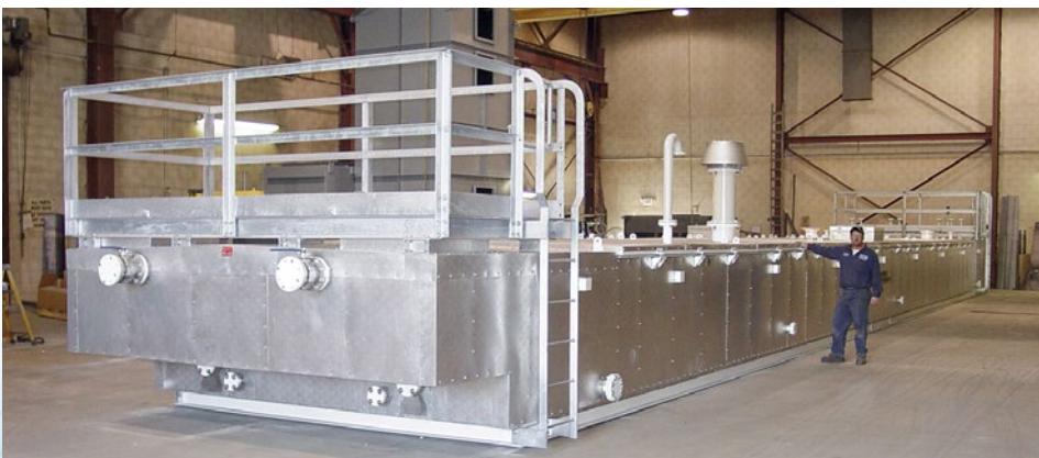
14 ft. x 90 ft. long 105 GPM API Separator with cover, mineral wool insulation, and aluminum cladding. The unit shipped from our factory fully assembled.

Complete covers of various materials are available including the necessary environmental and safety requirements. These provisions may include a nitrogen blanketing system, carbon filtering to remove hydrocarbons from the blanket gas, exhaust flares, pressure relieving valves, and access doors.